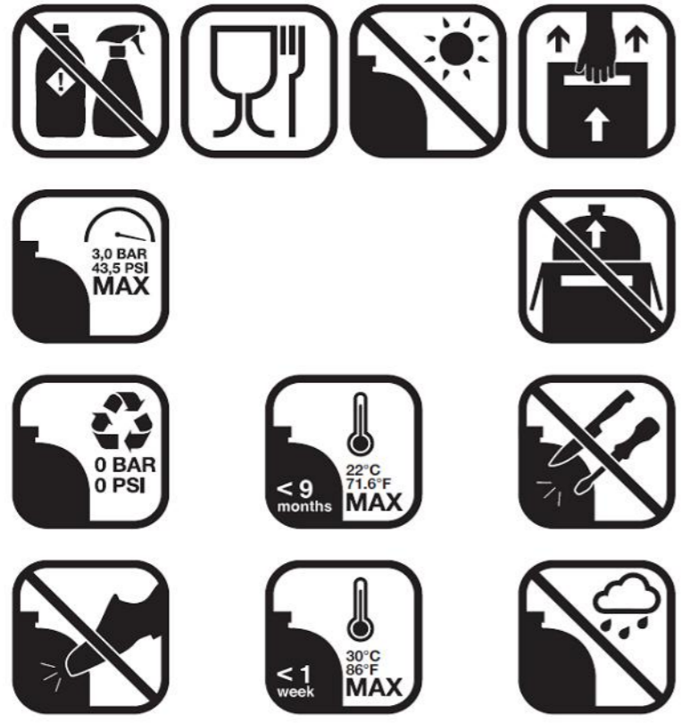
Detailed view of pictograms (x2)